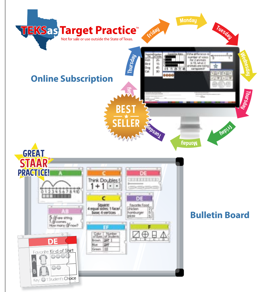
Page 2 Texas